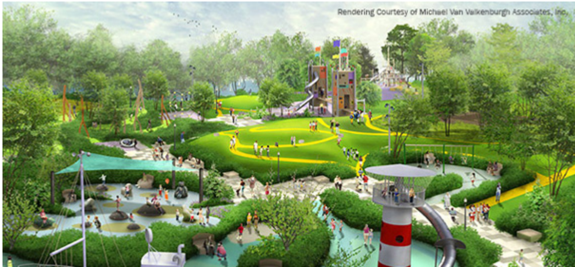
Maggie Daley Park rendering

Planning ( http://ucdenver.edu/Academics/Colleges/ArchitecturePlanning/Pages/default.aspx ) to University of Colorado ( http://ucdenver.edu/ ) Denver talent and training.